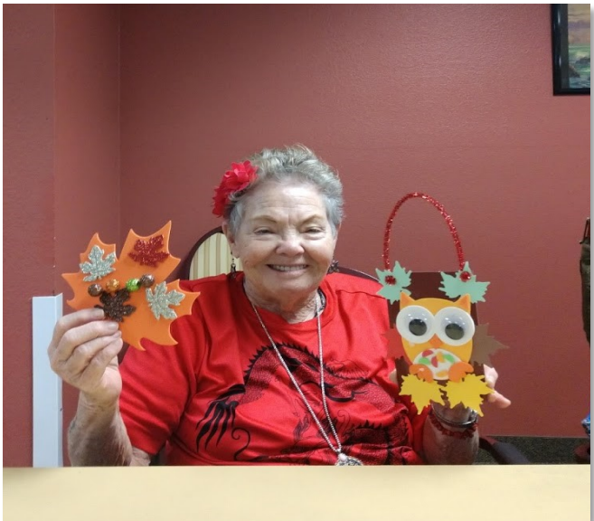
Fun Times At Silver Sky