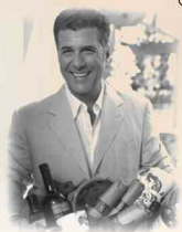
Chef Michael Chiarello

Award-winning celebrity chef and cookbook author Michael Chiarello has created some delicious seasonal dishes that make the most of autumn's bounty and make it easy to entertain.