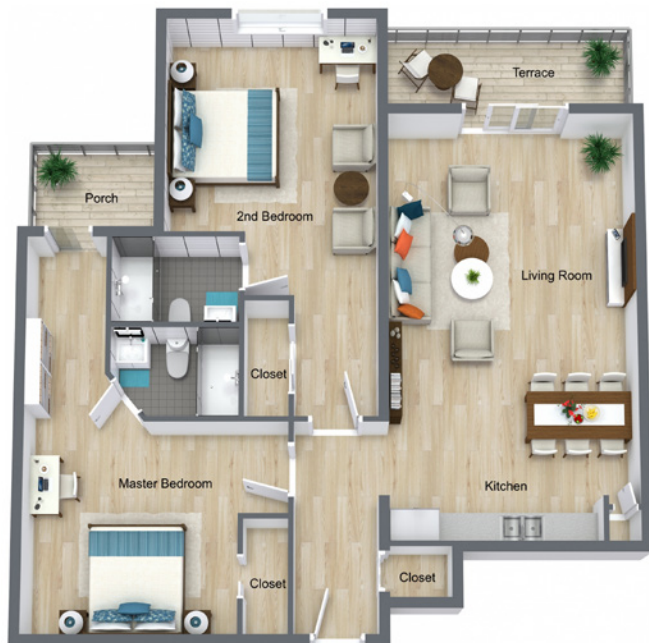
Independent 2 Bedroom