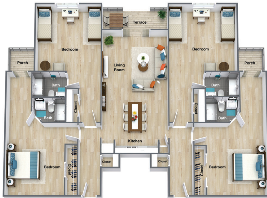
Quad Living Studio