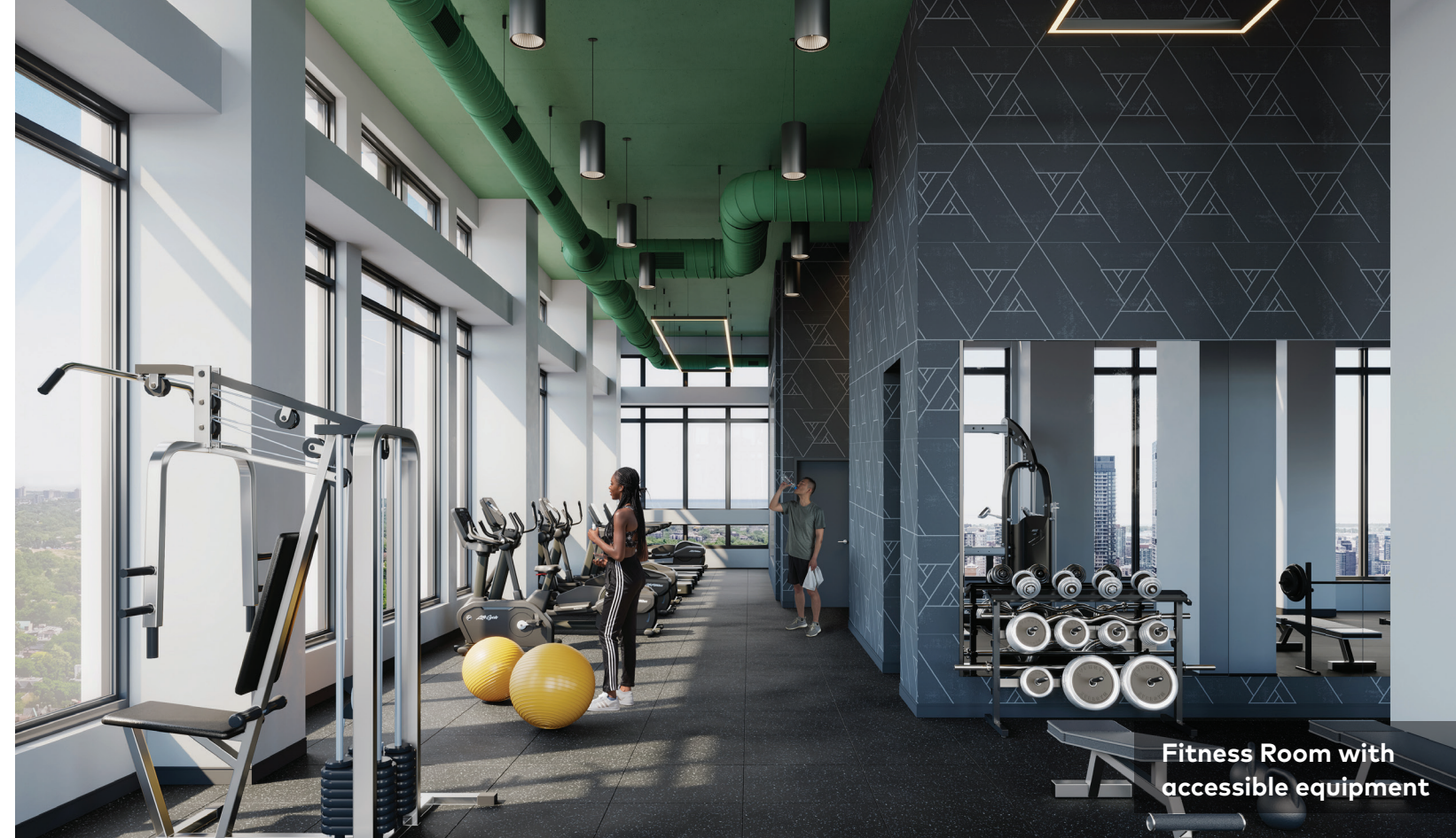
Fitness Room with accessible equipment