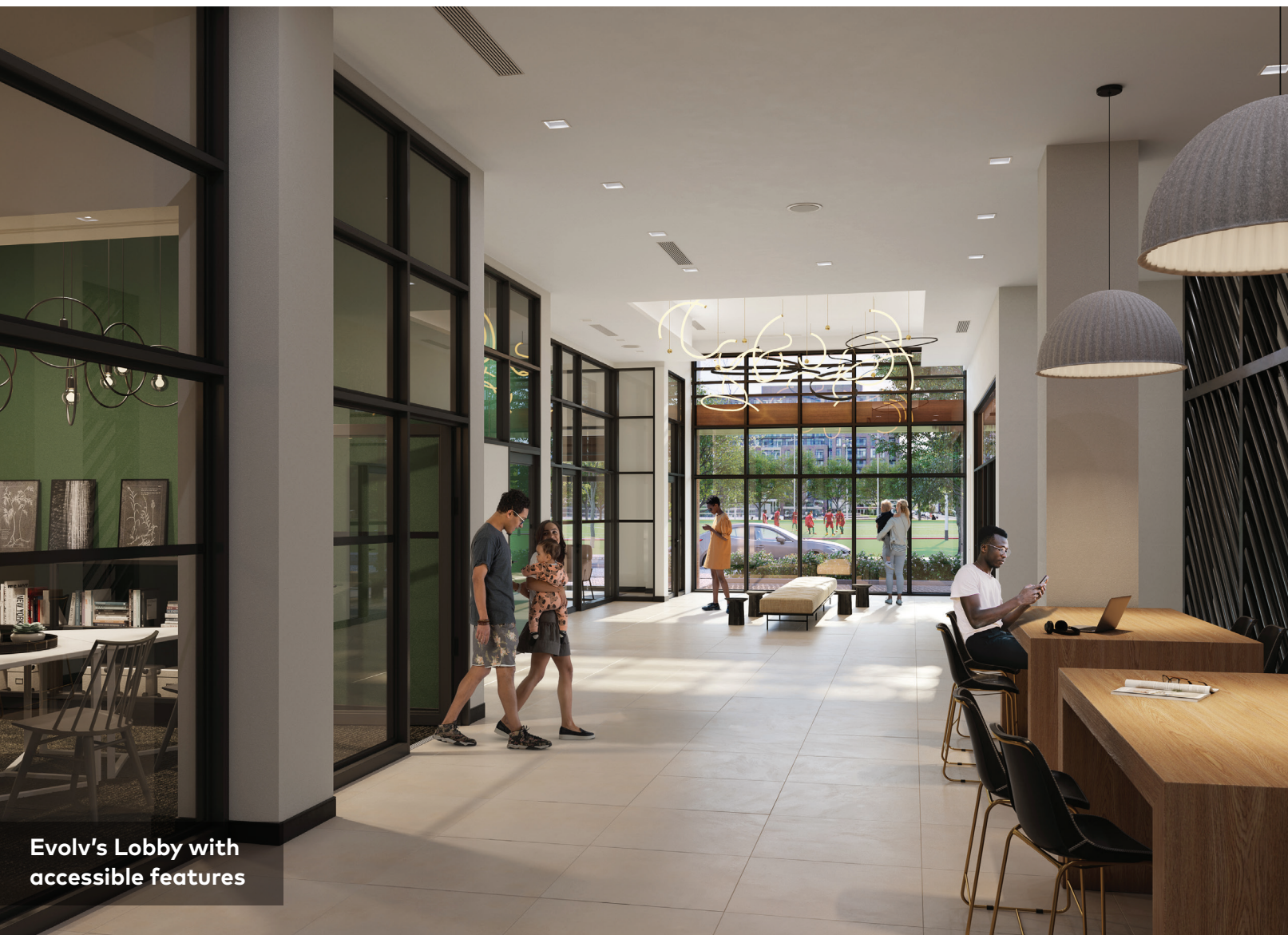
Evolv's Lobby with accessible features