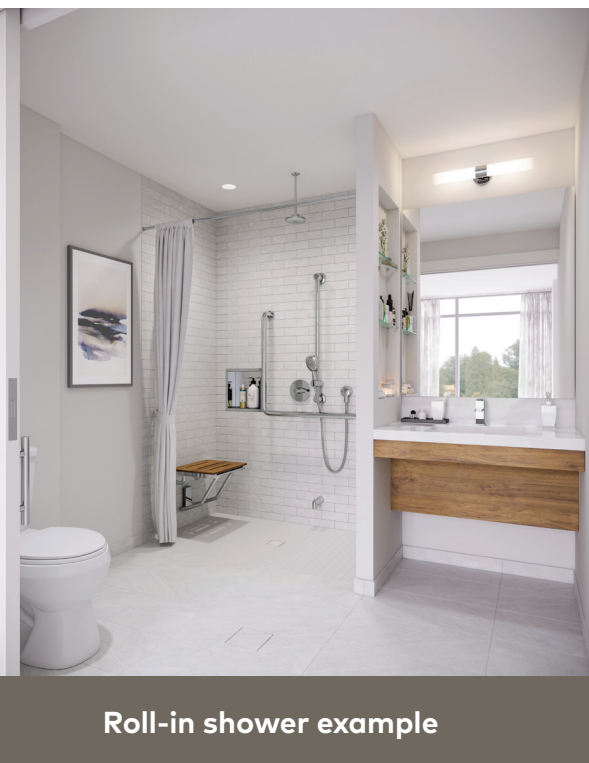
Roll-in shower example