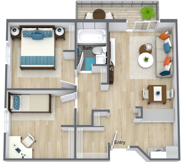
Ocean Breeze Spacious Two-Bedroom, One Bath