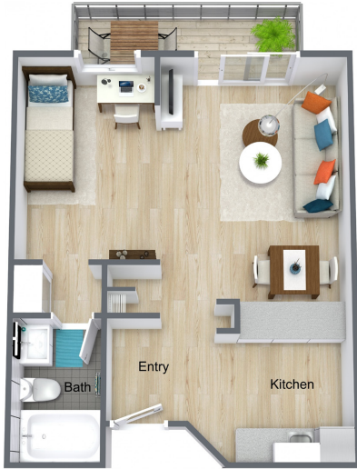
Cypress Spacious Suite