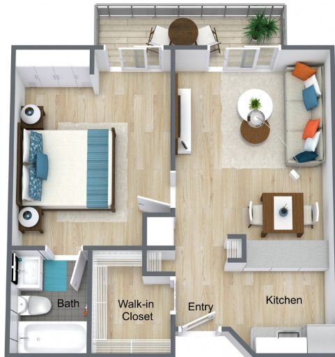
Sea Pine Spacious One-Bedroom