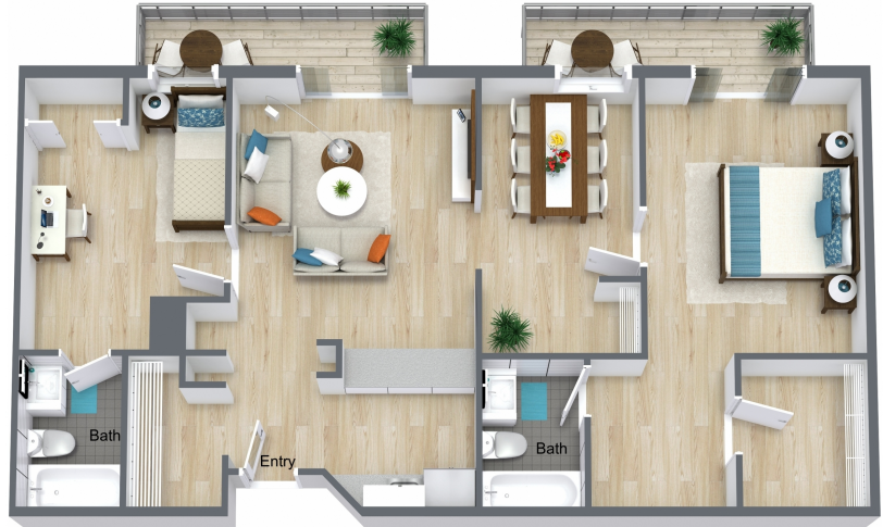
South Palm I Spacious Two-Bedroom, Two Bath