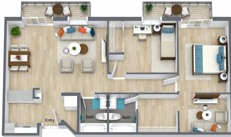
South Palm II Spacious Two-Bedroom, Two Bath