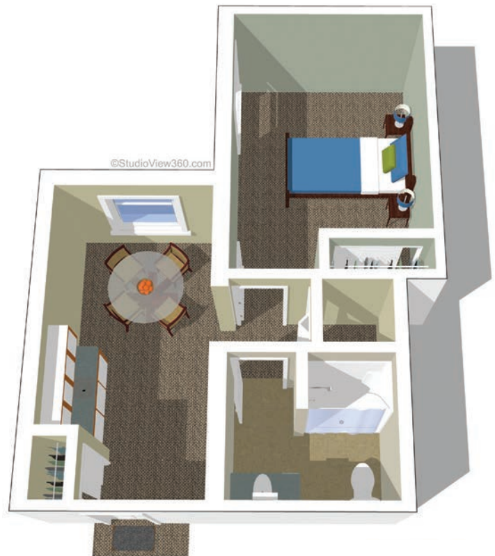
Memory Care One Bedroom 2 448 square feet