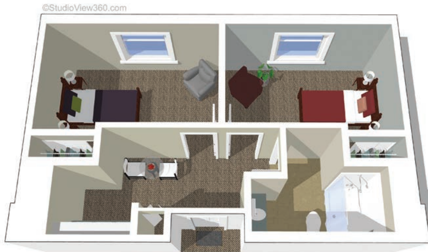
Memory Care Companion Suite 448 square feet