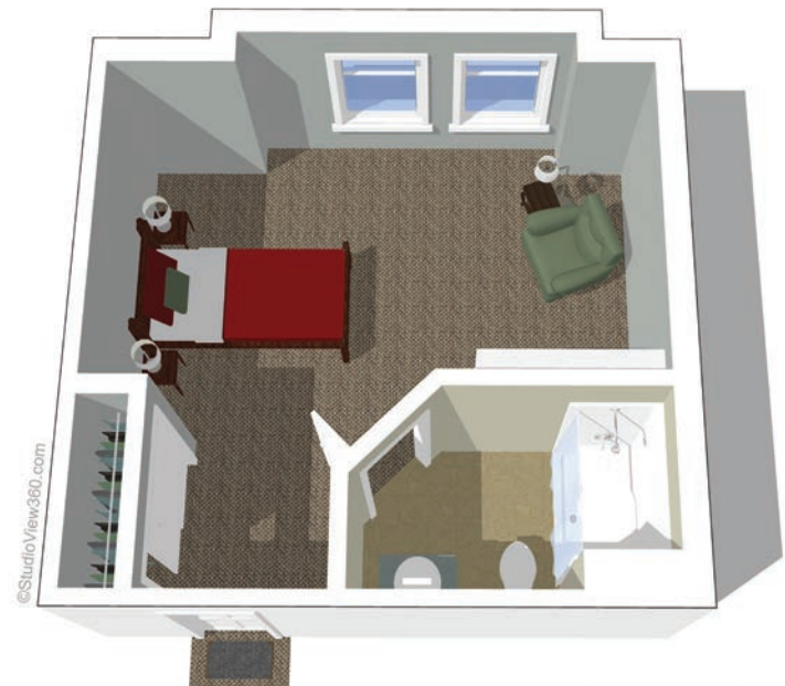
Memory Care Studio 320 square feet