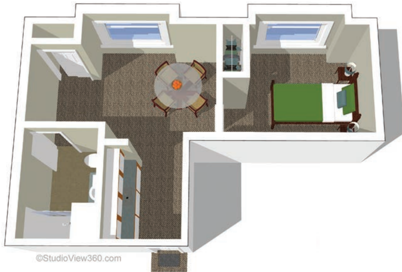
Memory Care One Bedroom 1 448 square feet