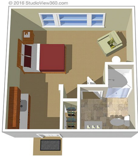
Studio 309-369 square feet