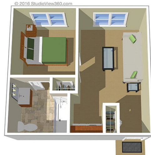
One Bedroom 420-450 square feet