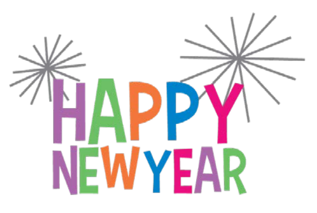
Jan 30 - Mgr weekend