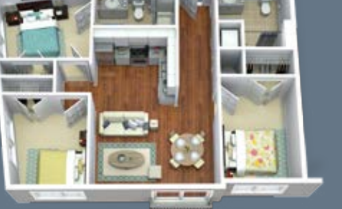
C2 910 sq. ft. 3 Bedroom, 2 Bath

Located just south of downtown Roanoke, South Sixteen offers modern living with incredible outdoor views. There are one, two and three bedroom apartment homes available, complete with contemporary architecture and elegant finishes.