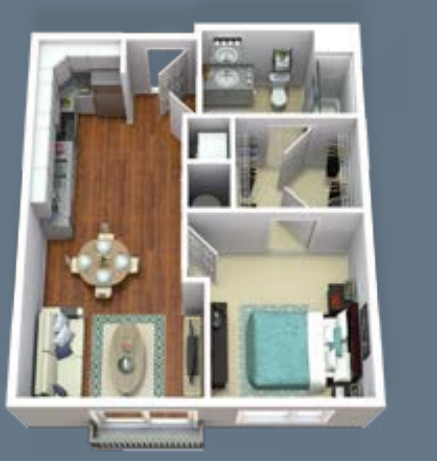
A2 600 sq. ft. 1 Bedroom, 1 Bath