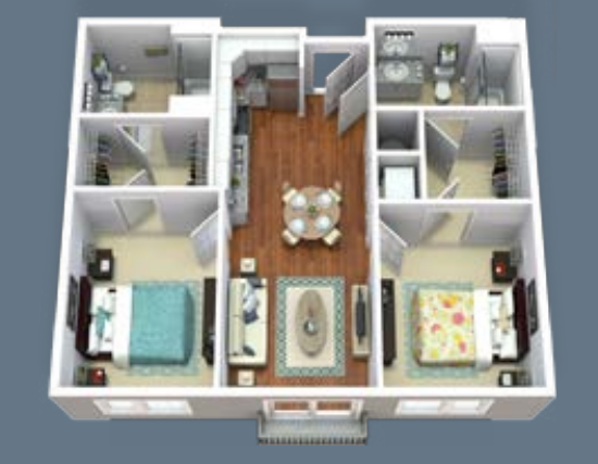
B1 835 sq. ft., 2 Bedroom, 2 Bath