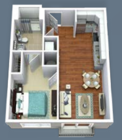
A4 551 sq. ft., 1 Bedroom, 1 Bath