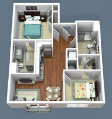
B2 820 sq. ft., 2 Bedroom, 2 Bath