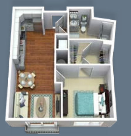
A3 585 sq. ft. 1 Bedroom, 1 Bath