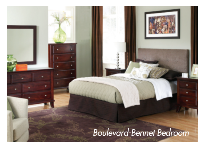
Items delivered may vary from those pictured. Actual items delivered will be from the same or higher product category.