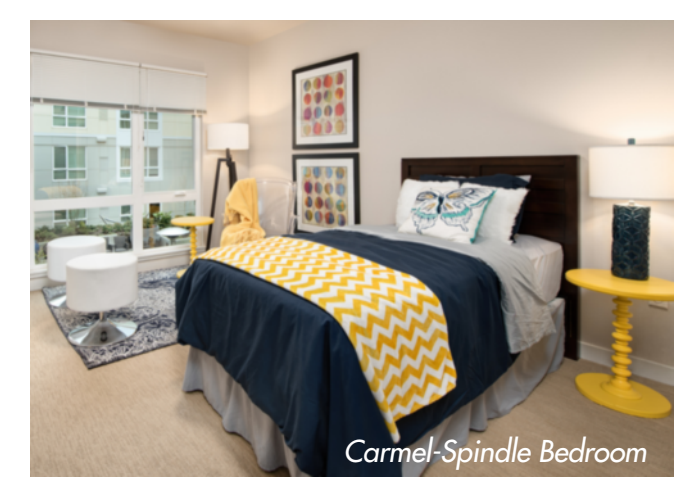
Items delivered may vary from those pictured. Actual items delivered will be from the same or higher product category.