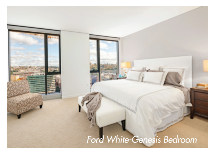
Items delivered may vary from those pictured. Actual items delivered will be from the same or higher product category.