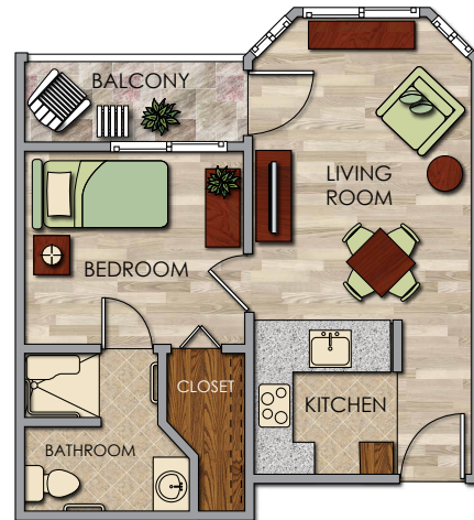
Deluxe One Bedroom