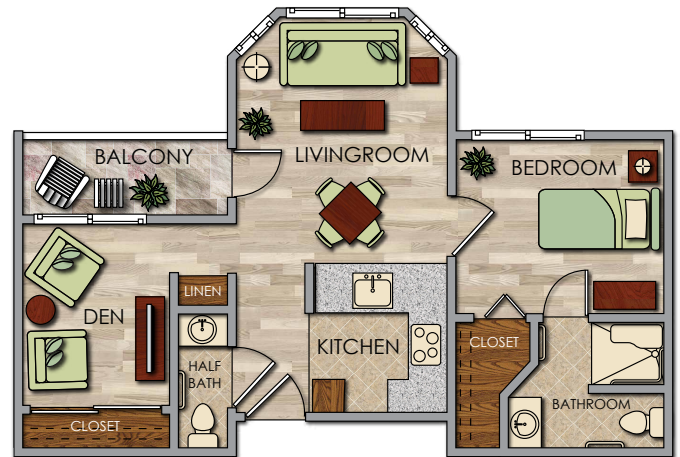
Deluxe One Bedroom & Den