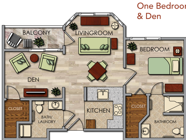
One Bedroom & Den