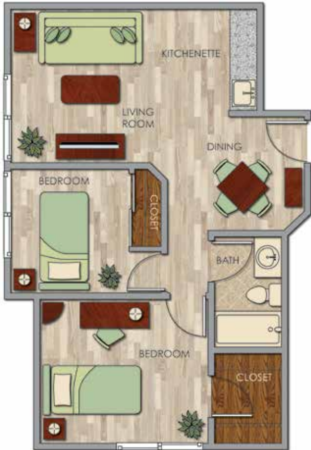
Canyon Rim Two Bedroom Apartment Home