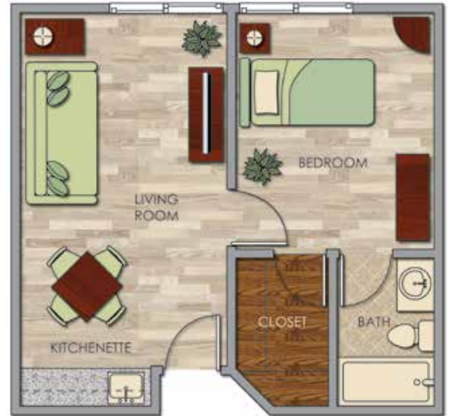
The Meadows One Bedroom Apartment Home