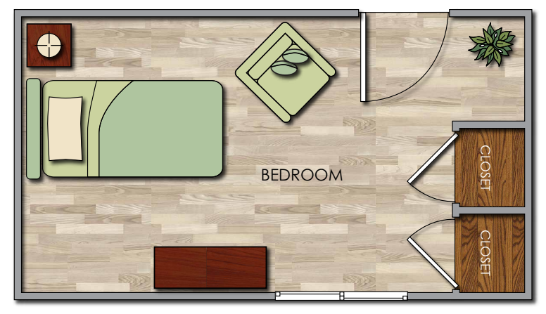
The Laguna - Memory Care Companion 1