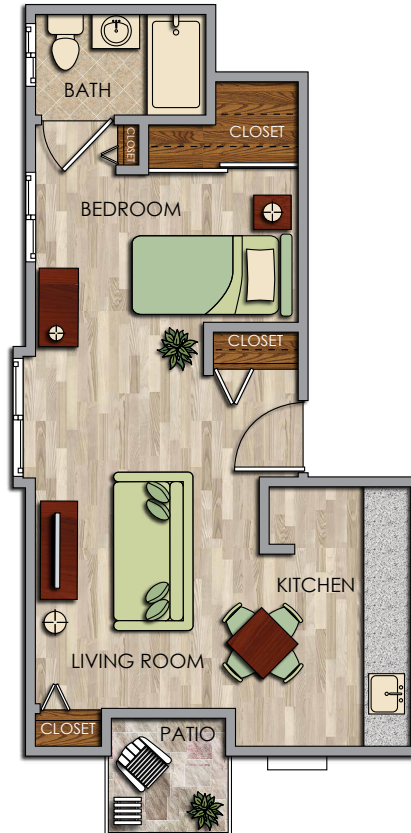
Alcove Studio Apartment