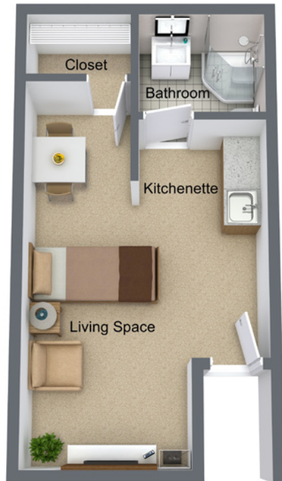
Studio Apartment Home