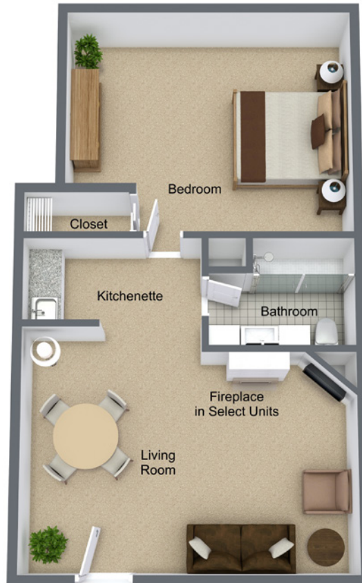
One Bedroom Apartment Home