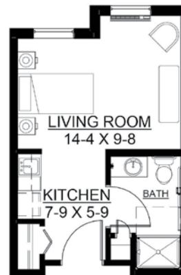
STUDIO / 330 sq. ft.