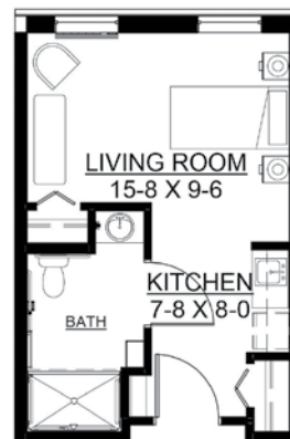
STUDIO / 353 sq. ft.