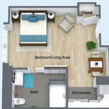
THE ROGERS Private Studio