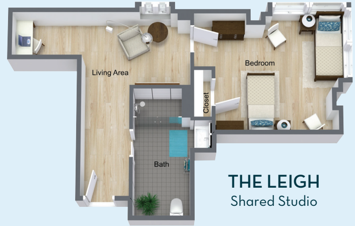
THE LEIGH Shared Studio