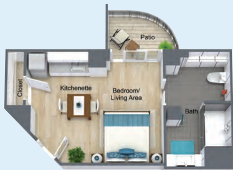
THE HAYWORTH Private Studio