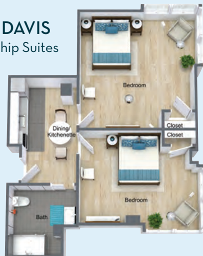
THE DAVIS Friendship Suites