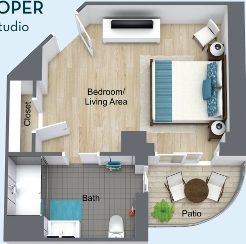
THE COOPER Private Studio