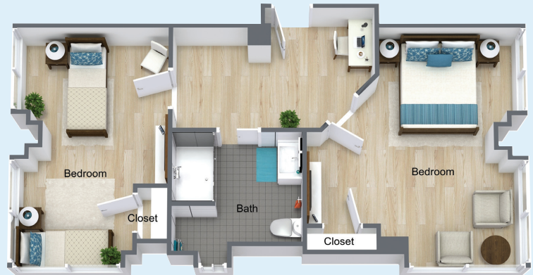
THE HARLOW Two-Bedroom Companion and Friendship Suites