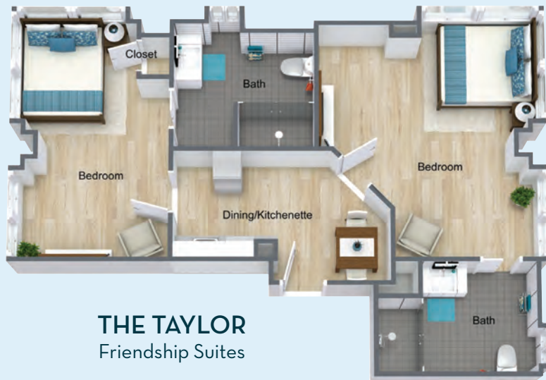
THE TAYLOR Friendship Suites