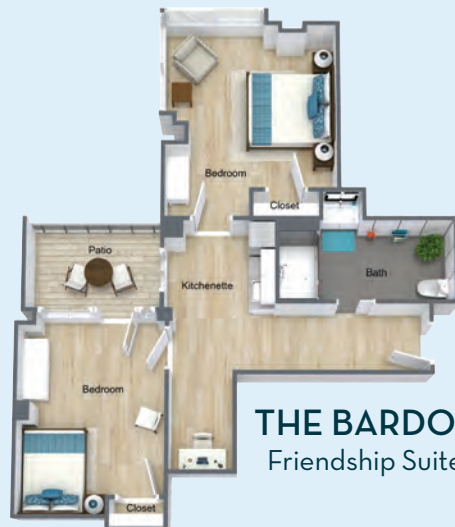
THE BARDOT Friendship Suite