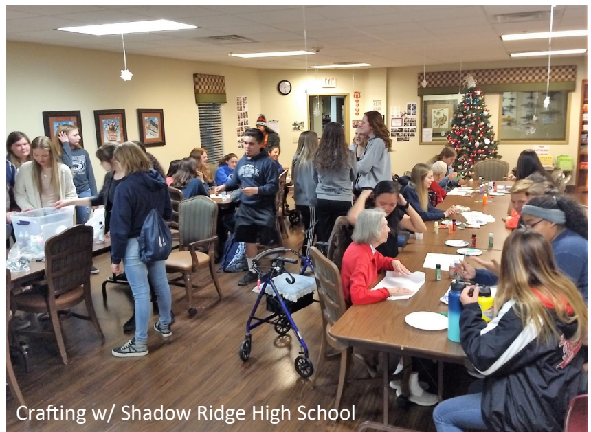
Crafting w/ Shadow Ridge High School