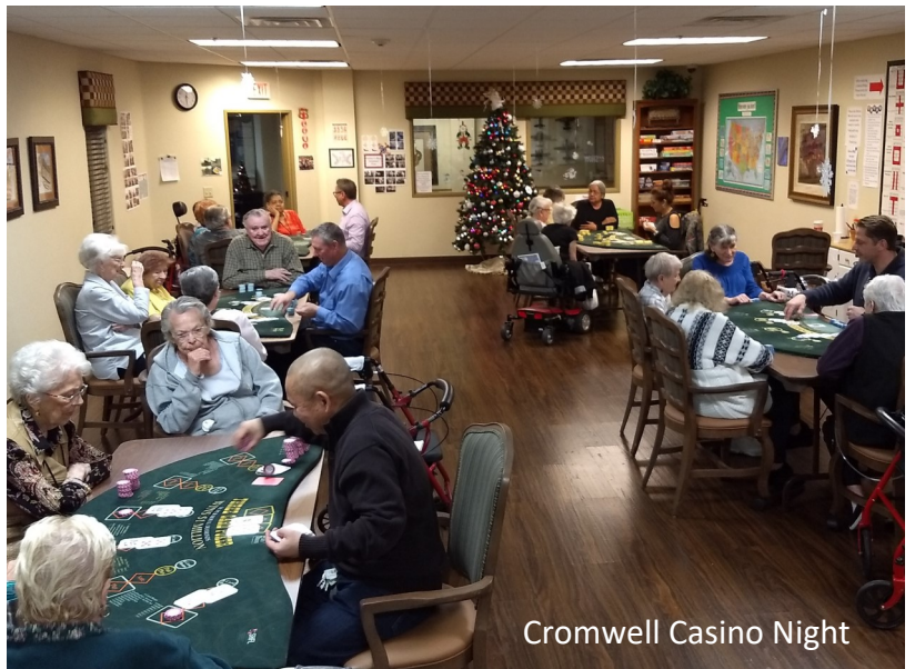
Cromwell Casino Night