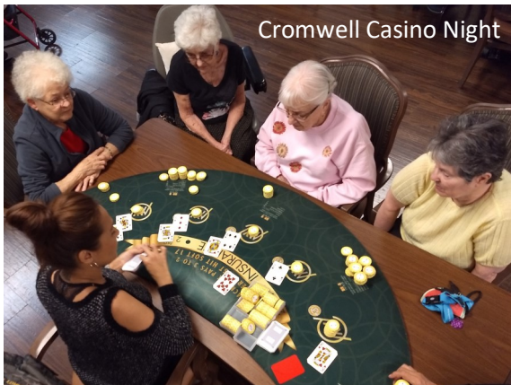
Cromwell Casino Night