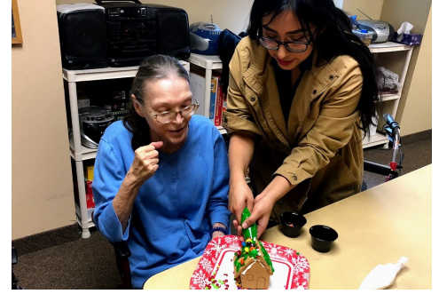
Putting our Gingerbread House Making skills to the test