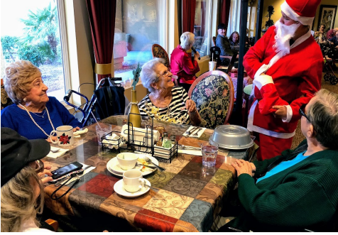
Santa made a special appearance during lunch!